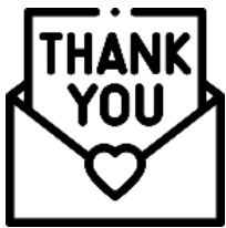
PICTURE 13: A Thank you Letter

Throughout the conference design, delivery, and monitoring, we are working with many wonderful colleagues and students who are providing their support to create an inclusive conference environment. We are grateful for all people who contribute with their dedication, time, and energy to make a successful event!