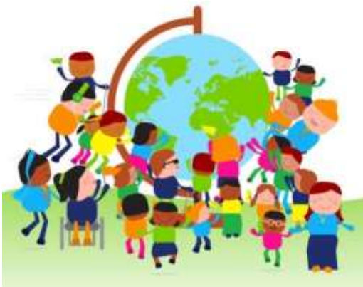
PICTURE 1: The picture displays people surrounding the globe