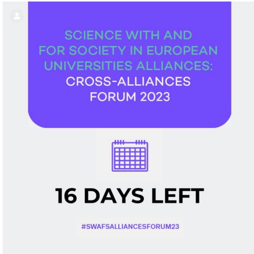
Figure 4. Countdown post published on Instagram

In addition to Alliances' Social Media channels, the communication group also encouraged the rest of the Alliances to publish information about the forum on their own newsletter. TORCH published the event in the CHARM-EU external newsletter from October 2023 5 as a highlight. Additionally, it was internally disseminated among partner universities.