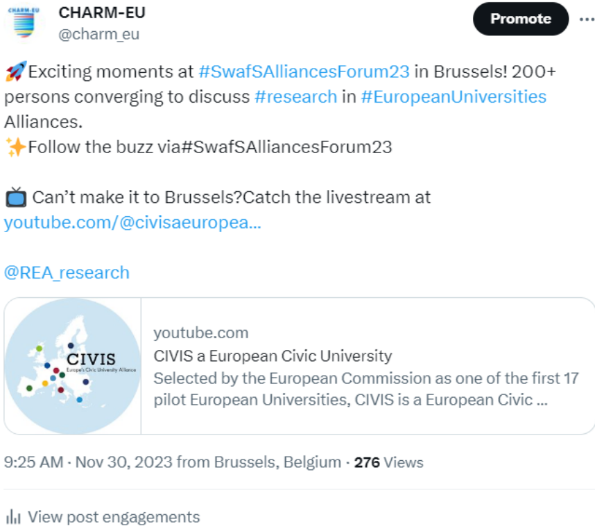
Figure 5. First post published during the event

Finally, the communication group worked on a post-event article. This piece is shared with the communication officers from the other Alliances. TORCH published this piece on their “Research” section in CHARM-EU website 7 and also published on CHARM-EU Social Media channels.