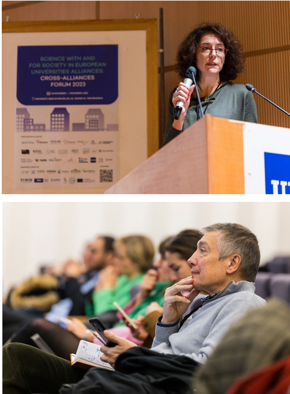
Figure 13. Photos from the workshop 1 “Advancing Our Common Science Agendas: building joint structures and support offices, pooling resources, capacity building, human capital, etc.”

The main conclusions from this workshop were that fostering collaboration within Alliances requires a deliberate shift from the notion of "neutralising" individual university cultures and practices to a focus on understanding and embracing diversity. Recognising that these unique aspects impact each institution's ability to engage fully in Alliance actions is crucial for effective collaboration. Additionally, striking a balance between the Alliance as a project and a long-term vision is essential, necessitating both strategic and administrative cohesion. Tailoring approaches, whether top-down