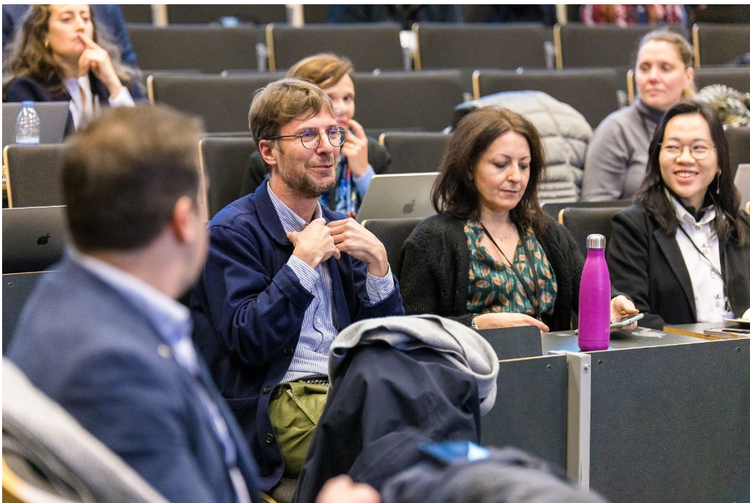
Figure 16. Photos from the workshop 4 “Inter- and Transdisciplinarity in research management”

Recognising the essential interplay between researchers and society, it is imperative that engagement with the broader community becomes a rewarding experience for researchers. Consequently, integrating the "3rd mission" into research assessments becomes a necessary consideration.