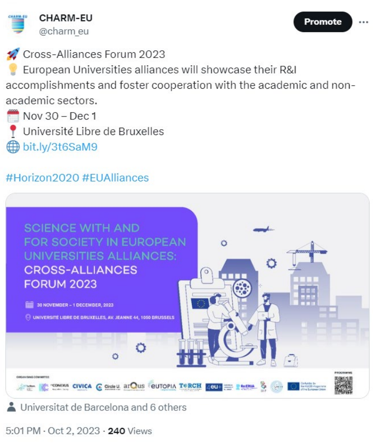
Figure 3. Presentation of the Cross-Alliance Forum 2023 in Twitter

The coordination with the rest of the participating Alliances was to publish these posts with similar text and the same visuals. Each Alliances could choose when to publish them depending on each calendar and priorities. The posts were prepared for Instagram, Facebook, Twitter and LinkedIn. Each Alliance could also choose the channel/s used to promote the event.