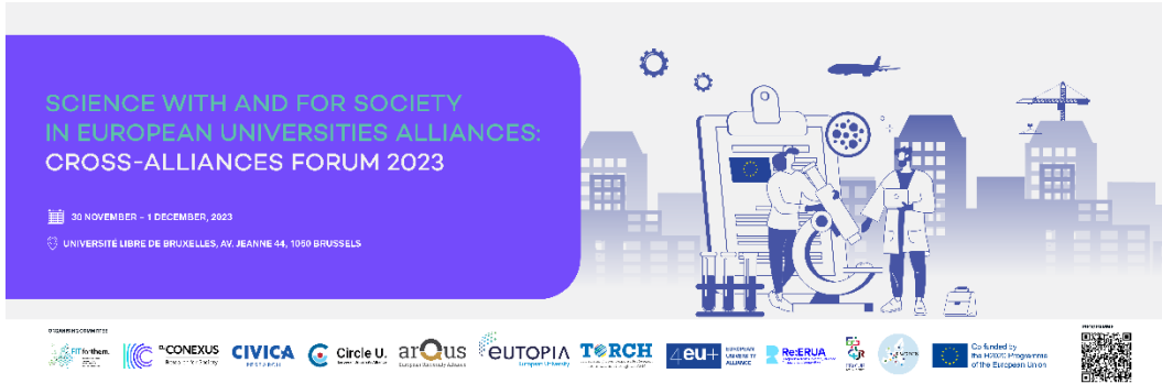
Figure 1. Banner with the visuals from the Cross-Alliances Forum 2023