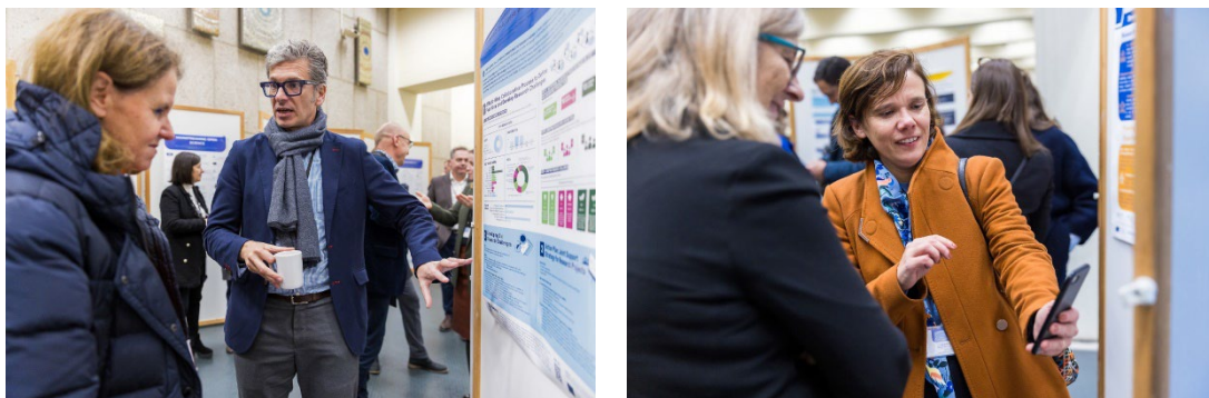
Figure 17. Photos from the interactive poster session