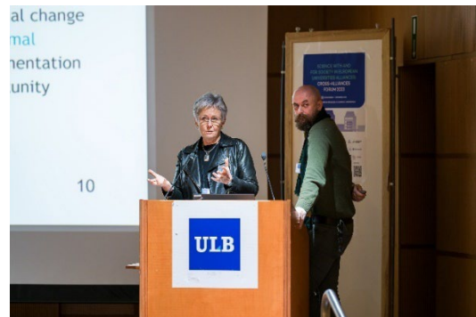
Figure 11. Photos from the session “Assessment of the R&I impact of the European Universities Alliances - reports by Commission and REA experts”