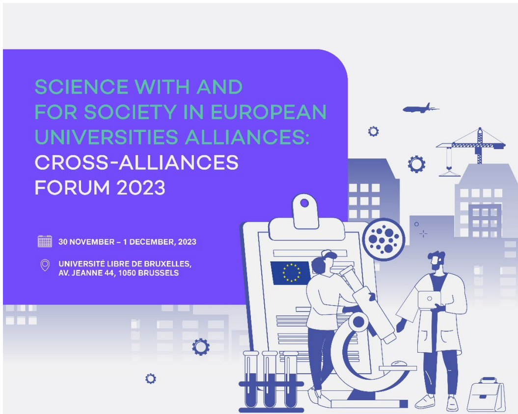
Figure 2. Instagram post visual with the visuals from the Cross-Alliances Forum 2023