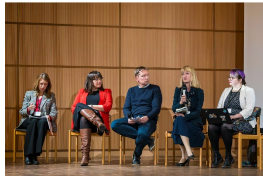
Figure 22. Photos from the closing session with Alliances' representatives and members from the European Commission, Stijn Delauré, Tine Delva and Minna Wilkki