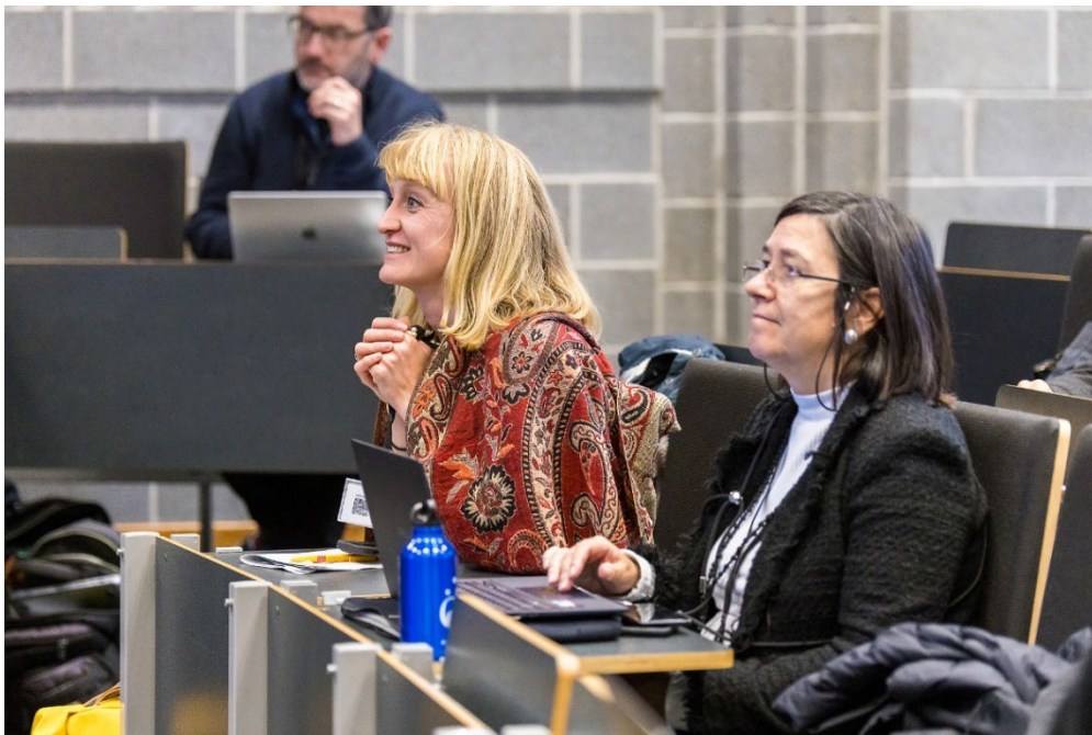
Figure 14. Photos from the workshop 2 “Pilots and Action Plans: what are the SwafS projects leaving for future developments of the Alliances’ R&I dimension.”