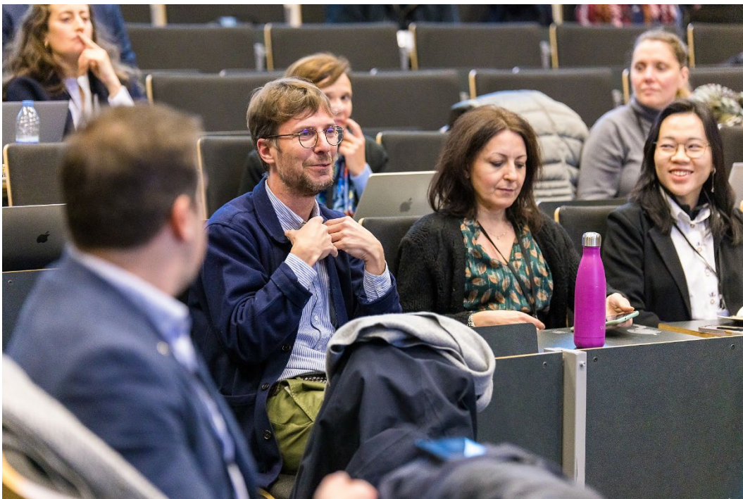
Figure 16. Photos from the workshop 4 “Inter- and Transdisciplinarity in research management”

Recognising the essential interplay between researchers and society, it is imperative that engagement with the broader community becomes a rewarding experience for researchers. Consequently, integrating the "3rd mission" into research assessments becomes a necessary consideration.