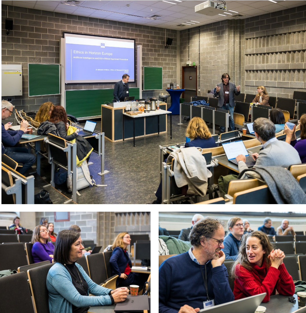
Figure 20. Photos from roundtable 2 “Research Ethics & Integrity: The Role of New Technologies”

utilised in research endeavours. This multifaceted exploration highlights the complexities and ethical considerations surrounding the integration of AI into various stages of the research process.