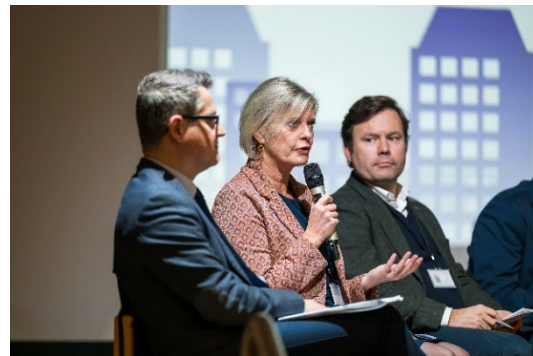
Figure 10. Photos from the session “Looking to the Future: The European Universities Alliances R&I Dimension”