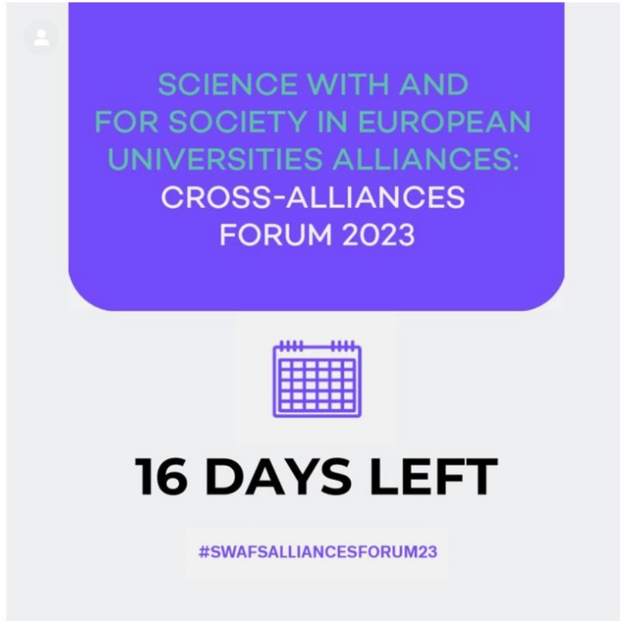
Figure 4. Countdown post published on Instagram

In addition to Alliances’ Social Media channels, the communication group also encouraged the rest of the Alliances to publish information about the forum on their own newsletter. TORCH published the event in the CHARM-EU external newsletter from October 2023 5 as a highlight. Additionally, it was internally disseminated among partner universities.