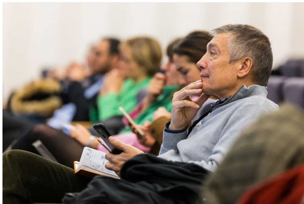
Figure 13. Photos from the workshop 1 “Advancing Our Common Science Agendas: building joint structures and support offices, pooling resources, capacity building, human capital, etc.”

The main conclusions from this workshop were that fostering collaboration within Alliances requires a deliberate shift from the notion of "neutralising" individual university cultures and practices to a focus on understanding and embracing diversity. Recognising that these unique aspects impact each institution's ability to engage fully in Alliance actions is crucial for effective collaboration. Additionally, striking a balance between the Alliance as a project and a long-term vision is essential, necessitating both strategic and administrative cohesion. Tailoring approaches, whether top-down