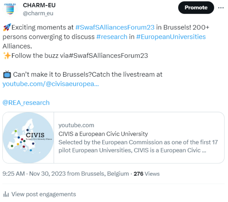
Figure 5. First post published during the event

Finally, the communication group worked on a post-event article. This piece is shared with the communication officers from the other Alliances. TORCH published this piece on their “Research” section in CHARM-EU website 7 and also published on CHARM-EU Social Media channels.