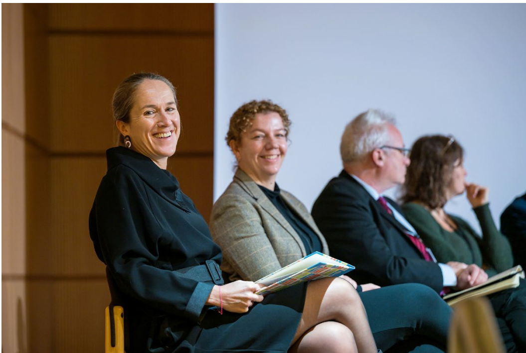
Figure 21. Photos from roundtable 3 “Responsible R&I: Fostering Societal Engagement & Involving External Stakeholders”