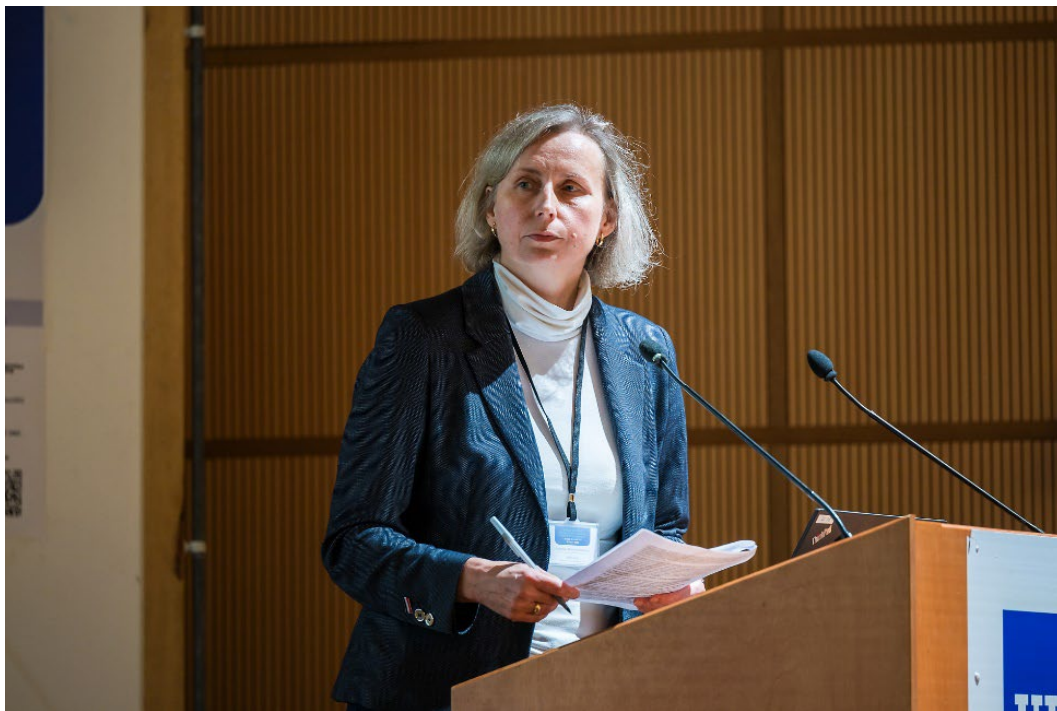
Figure 12. Photos from the session “From Agenda Setting to Implementation: Maximising the Institutional Impact of the SwafS Projects”.