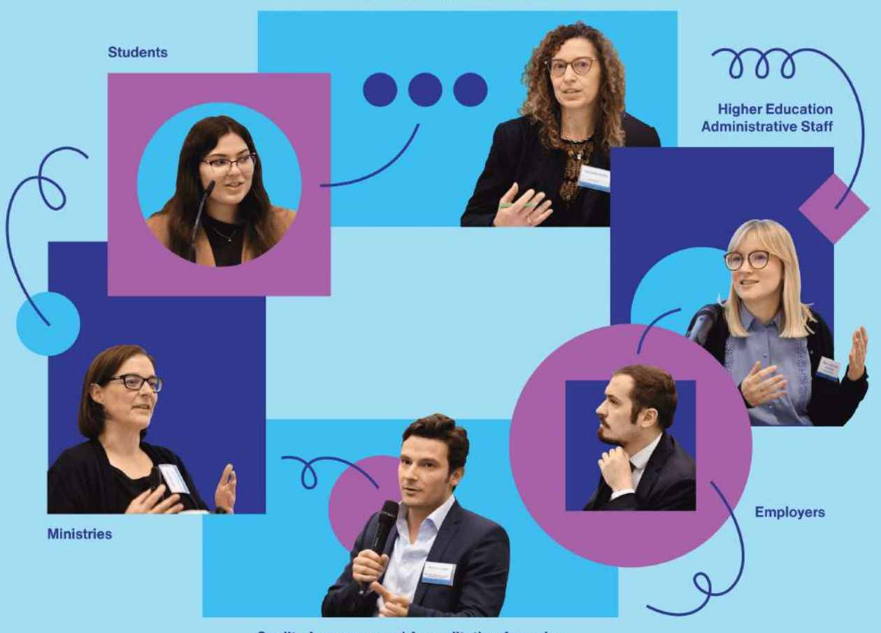
Quality Assurance and Accreditation Agencies

Engaging with students through questionnaires and meetings. Gathering over 2500 student responses.